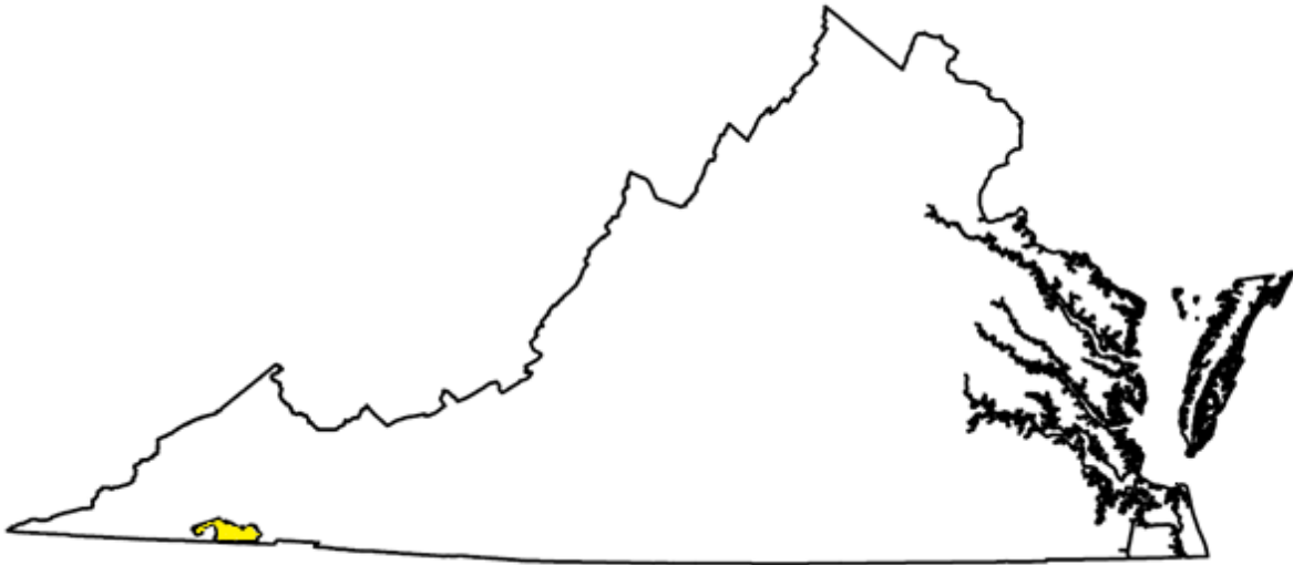
EXHIBIT A Bristol, Virginia